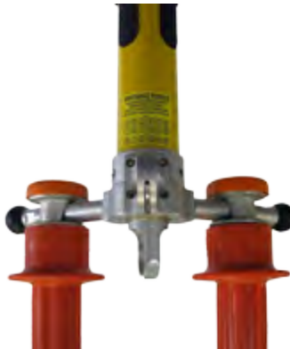
Dual Conductor Bars