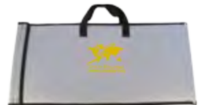
Optional Soft Case