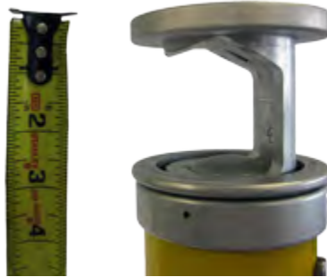
Extra Large Clamp