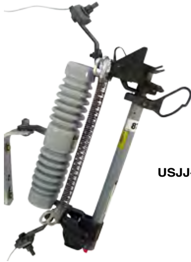
USJJ-006 27 kV SMD-20 Cutout Bypass Tool