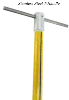
Stainless Steel T-Handle