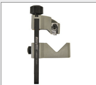
US10 URD Cable Insulation Chamfering Tool