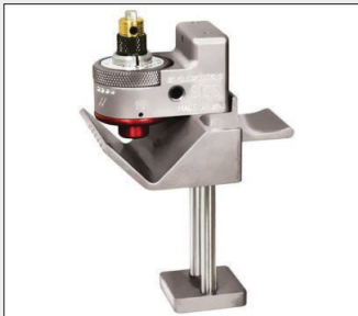
SCS Adjustable Cable Semi-Con Scoring Tool