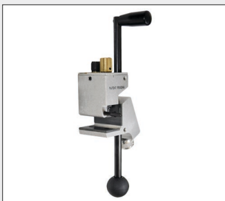
US01 Adjustable Cable Stripper