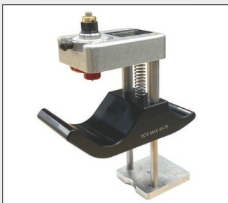
SCS-MAX 45-75mm Cable Semi-Con Scoring Tool