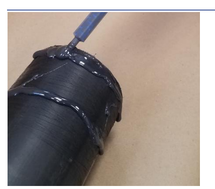
Apply BonDuit Adhesive

3. Clean the adhesion surfaces of both the conduit and coupling with cleaner wipe to remove any oils and displace water. Gloves are recommended.