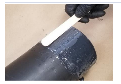
8. Using a tongue depressor, smooth the BonDuit XL around the conduit so it covers the entire conduit about the depth of the conduit.