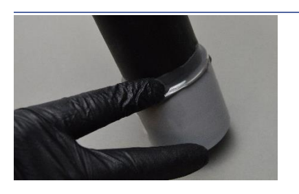
Spreading Bonduit on Conduit

9. Push the coupling immediately onto the conduit. A rubber mallet made be needed to ensure that the coupling is fully seated.