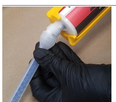
Attaching Static Mixer