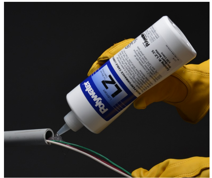
Polywater LZ is a specification grade lubricant

Coefficient of friction data on additional or specific cable jackets or conduits can be obtained from American Polywater Corporation.