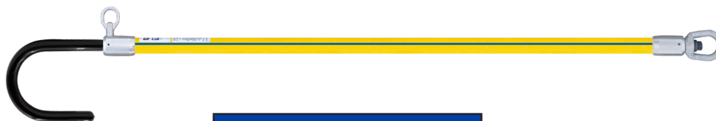
Item Number: USLS-022-XARM 22" HOOK & SWIVEL EYE END