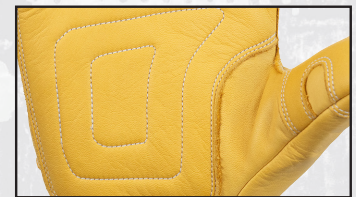
Reinforcement Layer for Durability